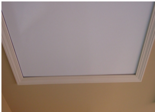
Radiant Barrier Side of Panel